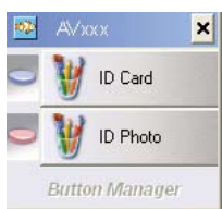
The Button Panel

1. After the Button Manager and the scanner driver have been successfully installed on your computer, the Button Panel will be displayed in the Windows System Tray at the bottom right corner of your computer screen.